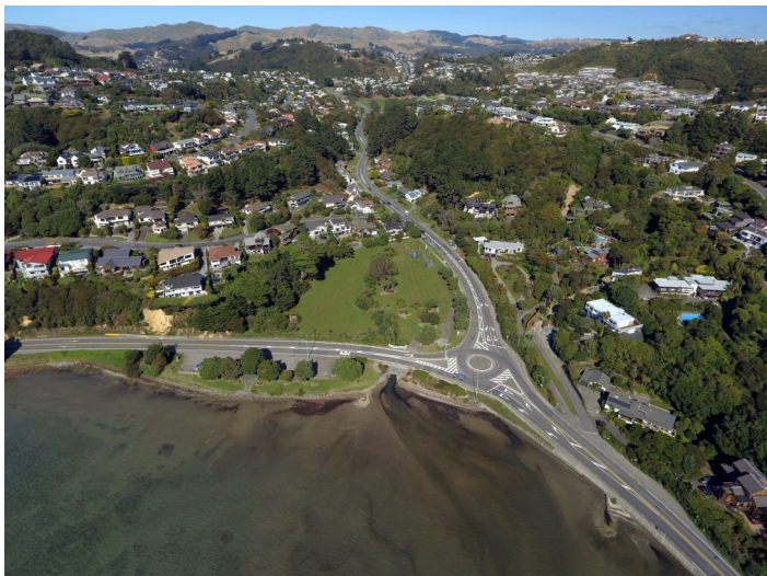
Browns Bay sub-catchment.

With the smallest sub-catchment of all, at only 1.2 km 2 , Browns Bay is also the most altered of the six drainage systems that feed the Inlet. Browns stream flows from the western boundary of Whitby, with its headwaters in the hills below Ascot Park at around 157 m AMSL. From here it travels for just 1200 m to the Inlet but most of the stream's original course has been obscured by major landscaping and the installation of stormwater systems for the housing developments around Staithe Drive and Postgate School. A second branch begins life just below Kahu Road and courses its way past Carvel Lane, through bush to Postgate Drive. From there it runs under the road to meet the main stream before emerging again at Browns Bay Park.