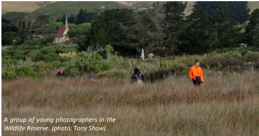
A group of young photographers in the Wildlife Reserve.

After the formal part of the workshop the participants spent an hour or so exploring the Pāuatahanui Wildlife Reserve and putting into practice what they had learnt.