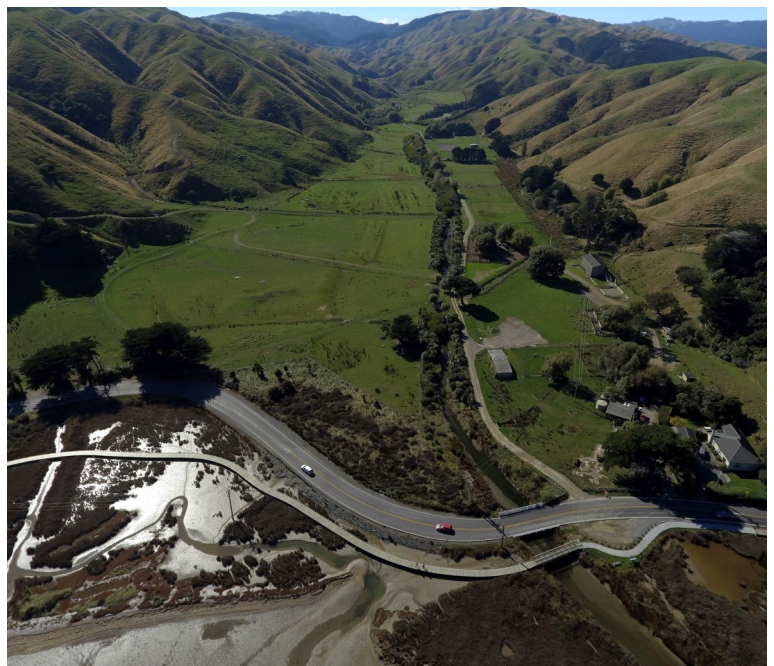
Kākaho sub-catchment.

The highest reaches of the stream run through non-native pine forest, planted in the 1970s. However, much of the catchment is pastoral with exposed unconsolidated deposits that have lost the original native forest cover and are now used for grazing. As a consequence the erosion risk is extreme. This was demonstrated on 15 November 2016 when a significant storm event, preceded by the Kaikoura Earthquake, resulted in flood waters thundering down the valley, carrying with it tonnes of dislodged top soil and rocks, damaging fences and other structures along the way. Established riparian planting, along the streambank and adjoining gullies, protected those areas, showing the value of the right kind of vegetative cover. The removal of all the forest cover in the 1850s changed the stream bed for ever.