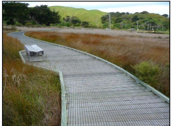
New walkway through the saltmarsh at the Kakaho estuary.

In the new year work will begin on re-aligning part of Grays Road so that it is moved inland by a short distance. The pathway itself will then be constructed on the landward side of the existing sea wall, eliminating any need for further reclamation, over and above that proposed under the original contract.