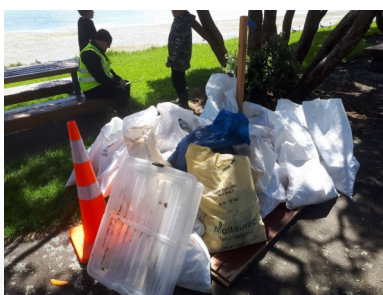
A sample of the rubbish removed from Browns Bay.