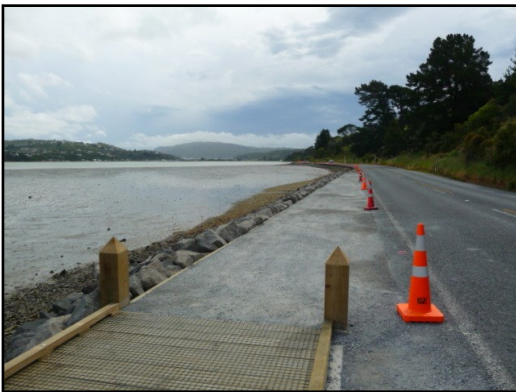
Final section of walkway under construction, looking towards Camborne.

Work on the current preparation phase of construction will largely be completed by Christmas with some minor finishing touches to occur in January.