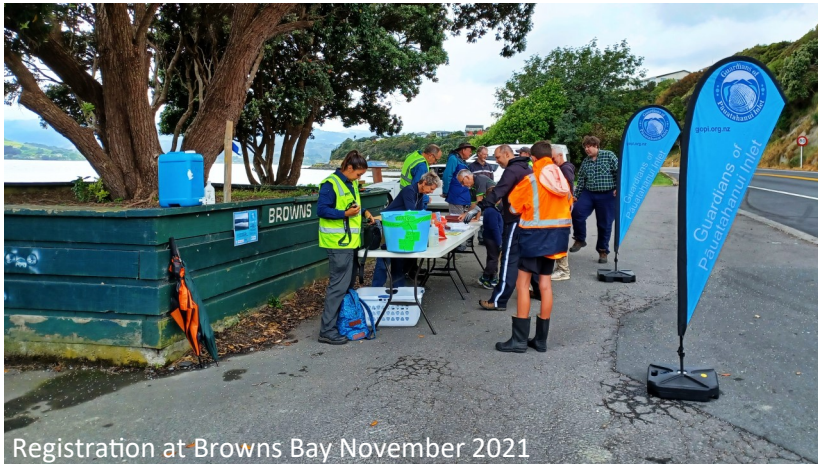
Registration at Browns Bay November 2021

Once a year we organise this community supported clean-up of all the shores circling the Pāuatahanui Inlet, an event normally held on a Sunday towards the end of the year. We select a day when the tide cycle is at its ebb, giving the best access to the shore, and in 2022 the scheduled date was 27 November. We always advertise that this event will go ahead come rain or shine and have never before had to cancel. But, on the day in question, the weather decided to exert itself to such a degree that it would have been very uncomfortable and generally impractical to go ahead with the event this time. In fact, at the appointed start time of 10:30 there was a deluge!