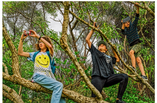
These three adventurous individuals climbed a tree to get a better view.

It's unfortunate that this particular day was more overcast than in previous years tending to make images a little flat in contrast and therefore not so dynamic. However a lot was achieved in the failing light and the youngsters made good use of the time with some exciting images created by many of them.