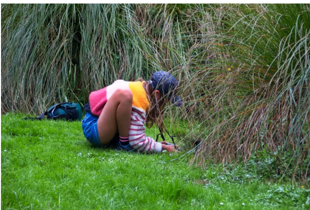
Getting down to ground level.

There were some adventurous individuals who took that extra step to capture the surroundings with flair and others that got down low to get some close-up detail.