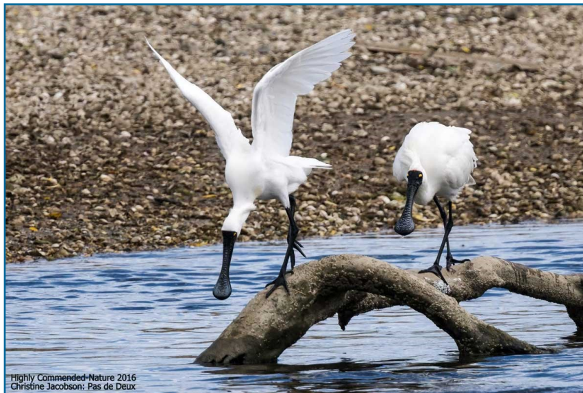
Highly Commended-Nature 2016 Christine Jacobson: Pas de Deux

The royal spoonbill is easily recognisable. A large, bulky but long-legged, white bird (80cm tall) with a very long heavy-weight black bill, distinguished by its outstanding spoon-shaped tip. It can often be seen